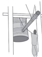
かね (temple bell)