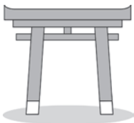
とりい (shrine gate)