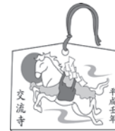
えま (good luck prayer tablet)