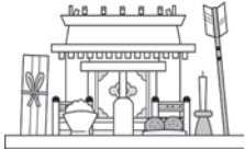
かみだな (household shrine)

Sculptures of Buddha along with other religious objects are mainly found in Buddhist temples (おてら). Buddhism exists in Japan side by side with Shinto, Japan's original religion. Below are Japanese religious objects, some of which are primarily associated with Buddhism and some with Shinto. Try to match the objects to their corresponding religion by filling in the chart below.