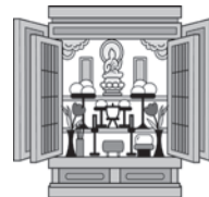
ぶつだん (family altar)